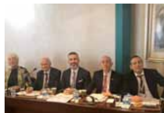
"Our Policy 2020 Meeting" is Held