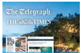
The Times and Telegraph, the Leading Newspapers of the UK, Speak Highly of Hillside Beach Club