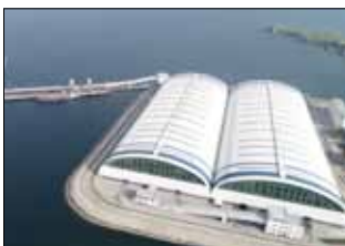
CENAL Karabiga Port Celebrates The Unloading Of Its 50 th Coal Vesse