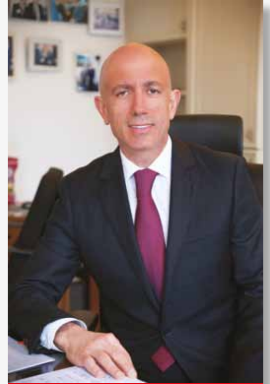
İzzet Garih Chairman of the Board

Production and export activities at the Alarko-Carrier facilities continued at an increased pace this year. We focus on R&D efforts and further increase our market share thanks to the condensing combi-boilers we produce with 100 % domestic technology. Thanks to our Toshiba range, we have a very good position in the split air-conditioner market. While continuing advertisement and marketing activities at full speed, we are also expanding our sales network in Turkey through authorized Toshiba dealers.