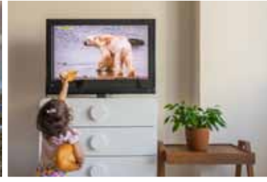
3. Ramazan Çirakoğlu