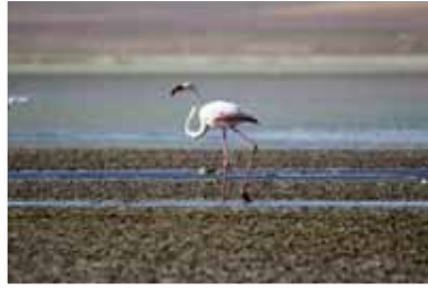
2. Mürsel Çetin